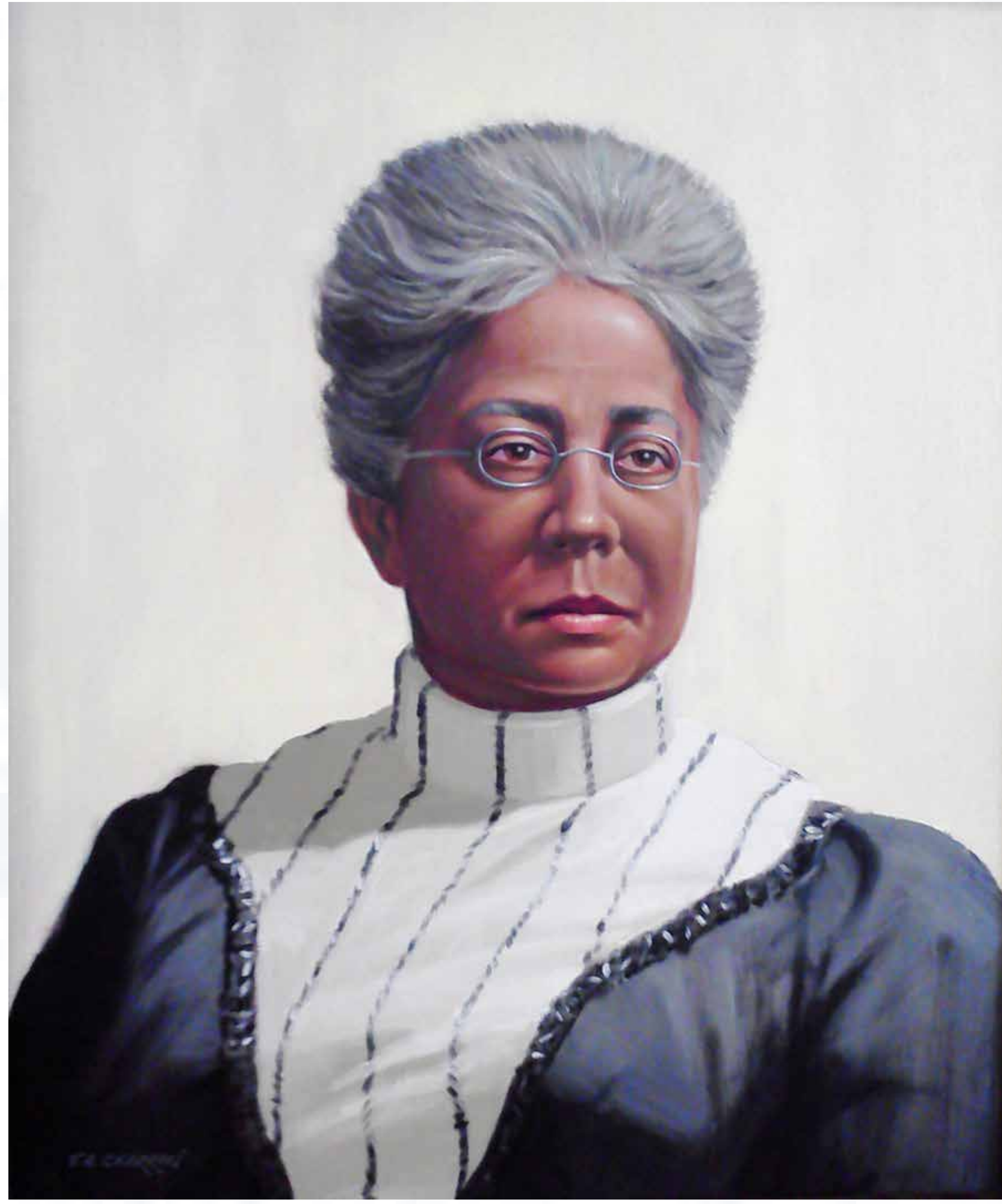
Josephine St. Pierre Ruffin W.E.B. DuBois described her as “an aristocratic lady,” others praised her dignity and “stately” demeanor. MASSACHUSETTS HALL OF BLACK ACHIEVEMENT