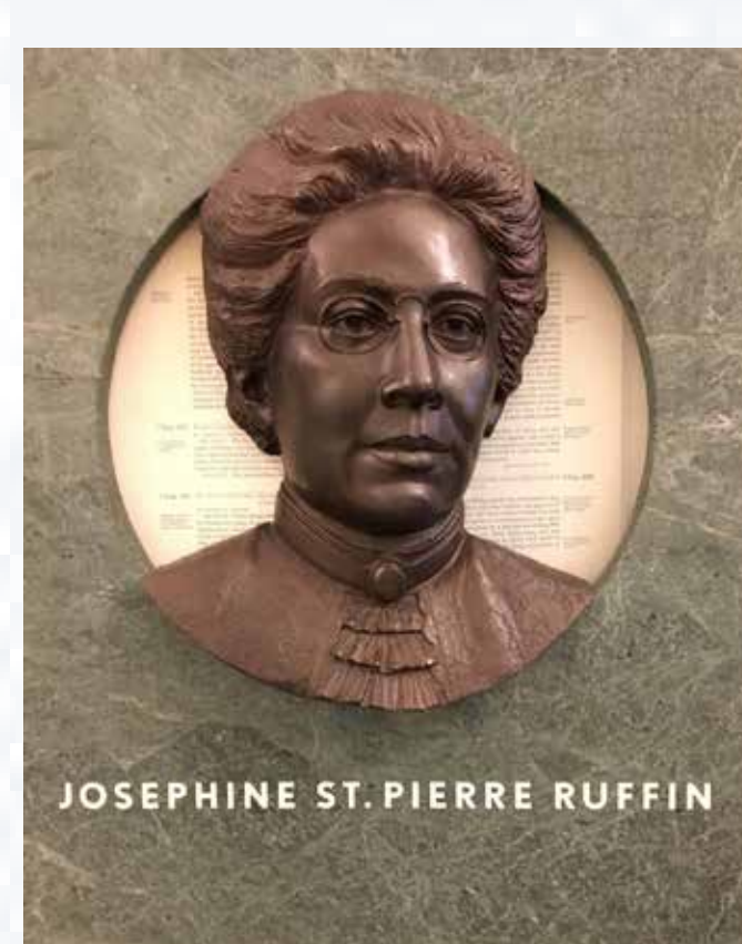
JOSEPHINE ST. PIERRE RUFFIN

At a national convention of women’s clubs in Milwaukee, another delegate ripped the membership badge from her dress. She was told that she could attend as a member of predominantly white women’s clubs, but not representing an African American club. She withdrew totally. The “Ruffin Incident” was reported nationally with most papers supporting her right to participate.