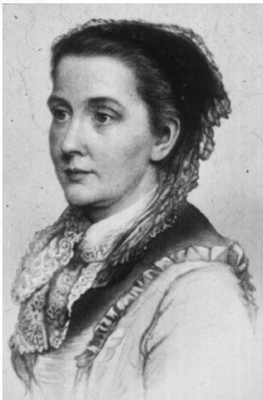
Julia Ward Howe.

On a visit to Washington D.C. in 1862 Julia Ward Howe listened as soldiers sang “John Brown’s Body,” eulogizing the radical abolitionist hanged for raiding the arsenal at Harper’s Ferry. Staying at the Willard Hotel, she awoke during the night with an idea for new lyrics. She wrote a draft, fearful that she might forget them. Majestic and inspiring, her words for the “Battle Hymn of the Republic” cemented her place in American history.