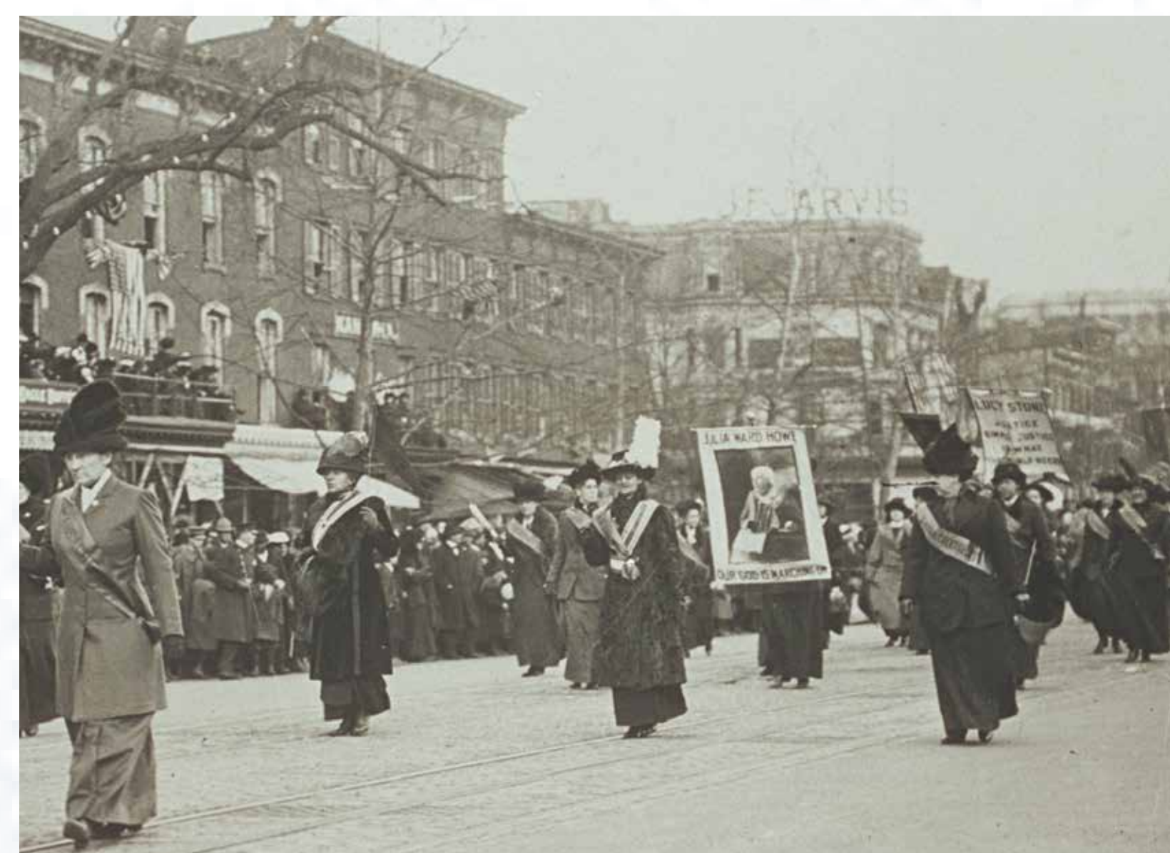
In the March 3, 1913 women’s suffrage parade in Washington D.C., the Massachusetts delegation carried a banner with the image of Julia Ward Howe. The suffrage cause was a central concern during her later years.