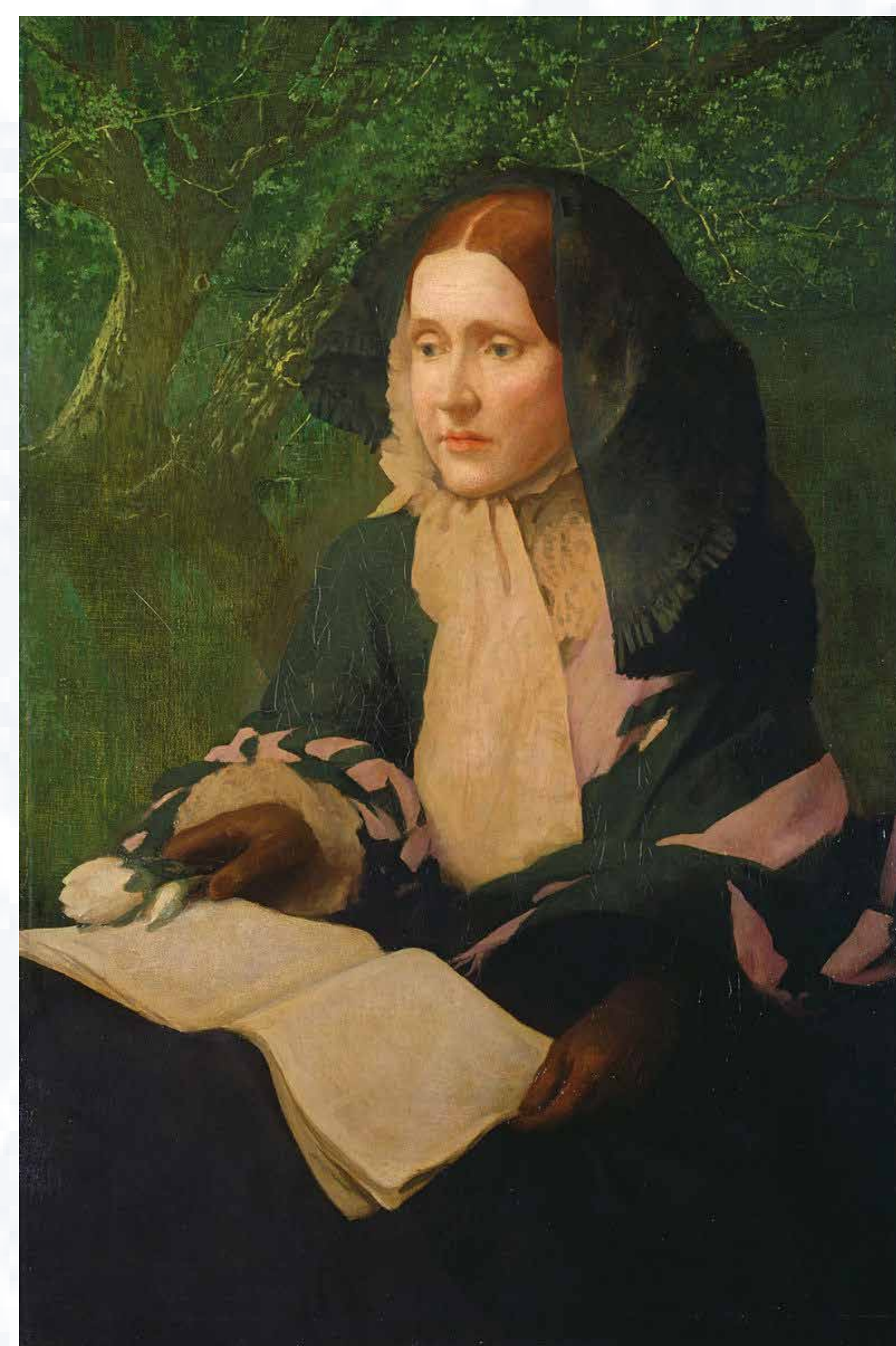
Julia Ward Howe.

“Lastly and chiefly...I have had the honor of pleading for the slave... and helping to initiate the women’s movement in many States of the Union.” Julia Ward Howe, Reminiscences, 1899