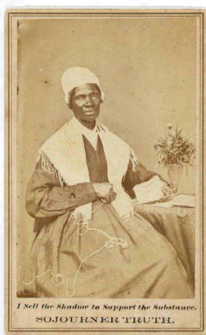
Truth sat for several versions of this image, and sold it at lectures, along with her Narrative.

Her first recorded appearance, as a social reformer, was at the 1850 Woman's Rights Convention in Worcester. She delivered an early abolitionist lecture in Plymouth, criticizing Massachusetts Senator Daniel Webster for supporting the Fugitive Slave Law.