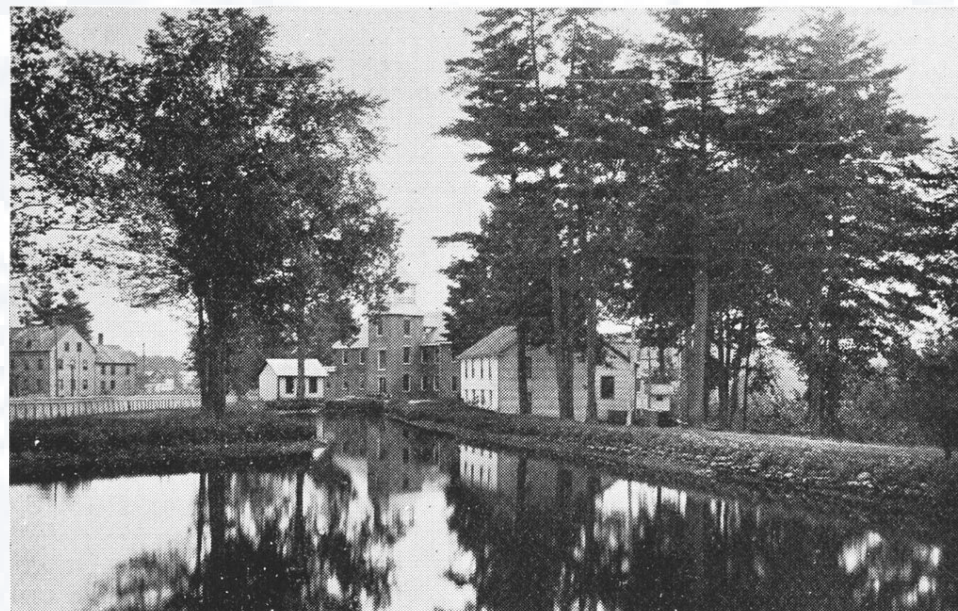
The Northampton Association of Education and Industry was a utopian community dedicated to reform. Sojourner Truth worked and lived in the factory building for a time.