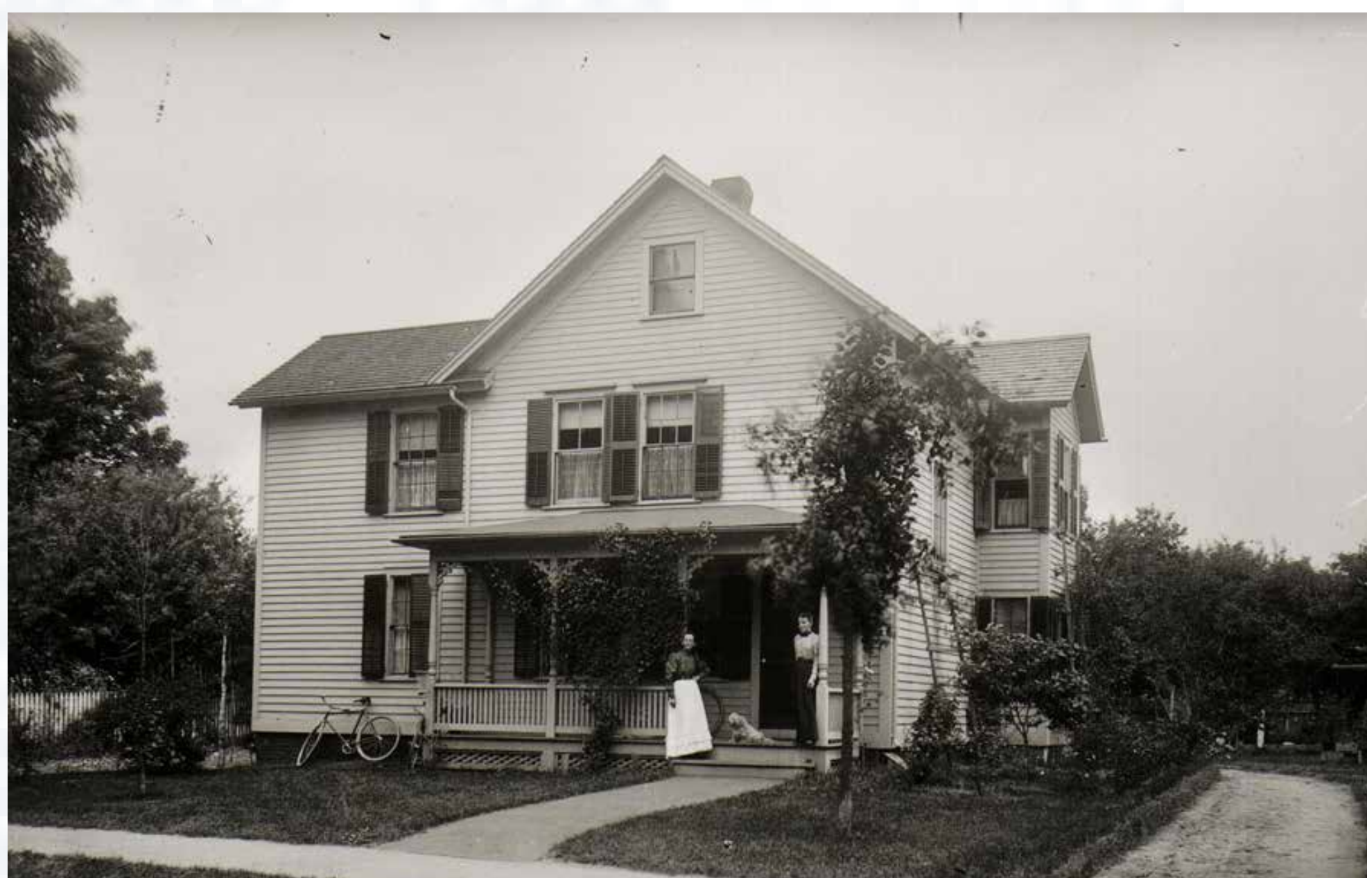
From 1850 to 1857 Sojourner Truth lived in this Florence home. She spent fifteen years in Massachusetts and dictated an early version of her Narrative while in Florence.

Born into slavery in upstate New York, “Isabella” took the name Sojourner Truth at the age of forty-five. She had been sold five times before “walking” away from slavery, one year before it was officially abolished in the state. (In her Narrative, she emphasized “I did not run away, I walked away by daylight.”) Although she never learned to read or write, Truth became a powerful itinerant evangelist, stressing religious themes at first.